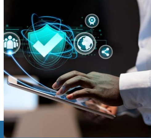
Disaster Planning & Data Security