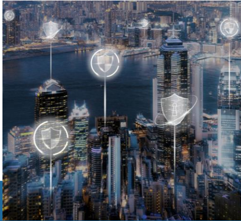
Cyber Security Audits