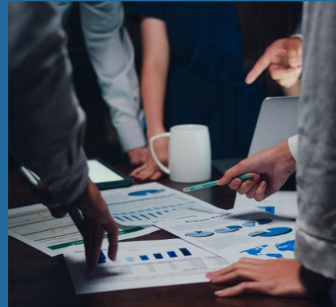
Migration and Projects Consulting