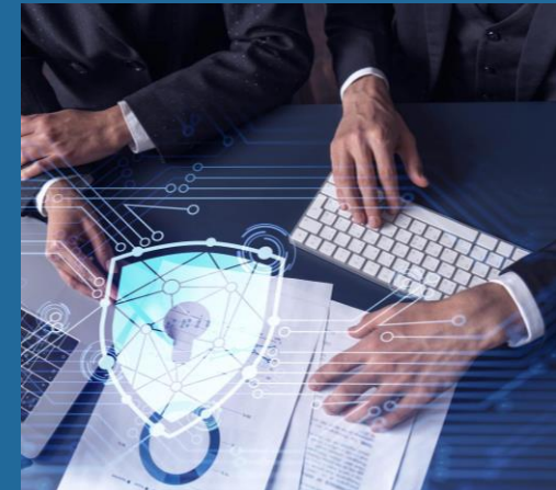
Security Operation Center