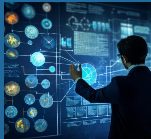
IT Asset Management