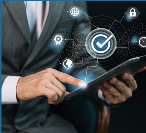
IT Compliance Audit Services