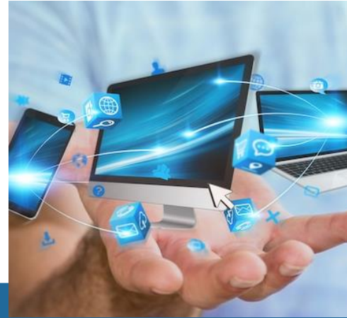
IT Mobile Device Management Services