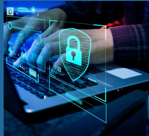
Antivirus & Malware Management