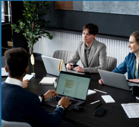
It Asset Management Outsourcing Services