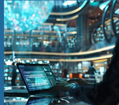
IT Infrastructure Monitoring