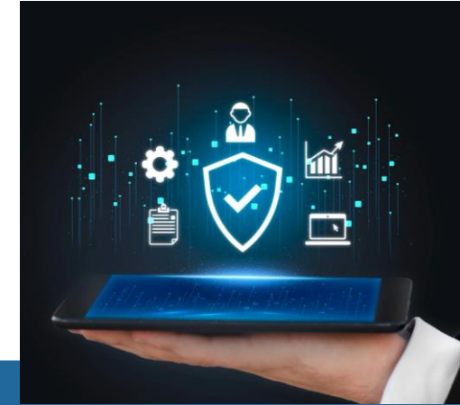
IT Security Management