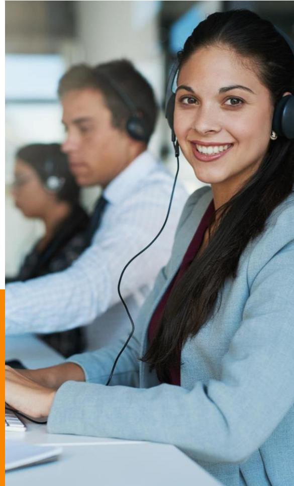
Microsoft Azure Consulting

KnoTra Global: Elevating Your Cloud Strategy with Expert Consulting Services