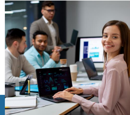
Workstation Management Services