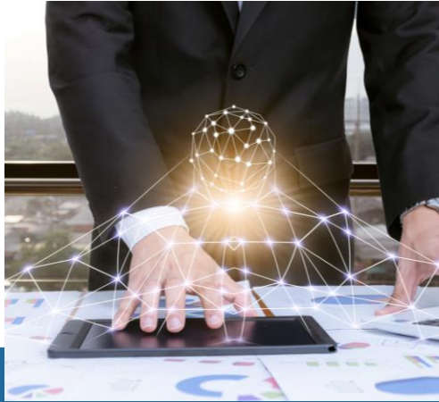
CIO Service Consulting