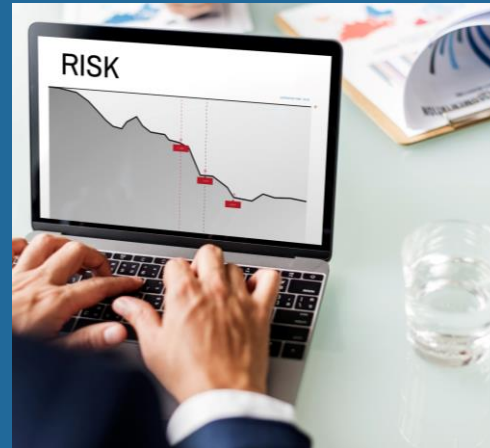
IT Risk Management and Assessment