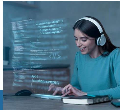
IT Backend Support Services