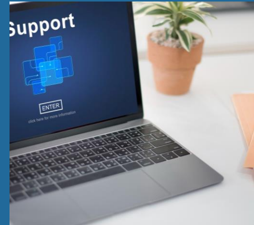
IT Desktop Support