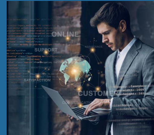
IT Network Management