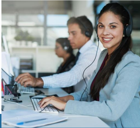
IT Service desk